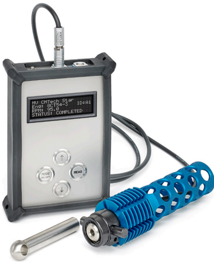
PREMET M with Sensor

Newly developed and part of CMT's modern range of PREMET® diesel performance analysers the PREMET® M is the way to go if you are looking for an economic approach to monitor your engines without sacrificing quality and accuracy. Brand new technologies give the user an unparalleled accuracy and will ensure you are getting results you can act on. Designed by marine engineers to be used from marine engineers the PREMET® M helps balancing cylinder load, optimise injection timing and detect worn or damaged engine components and thus reducing the engine's operating cost.